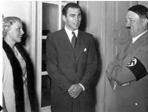
Schmeling, who was never a Nazi, was warmly received by Hitler