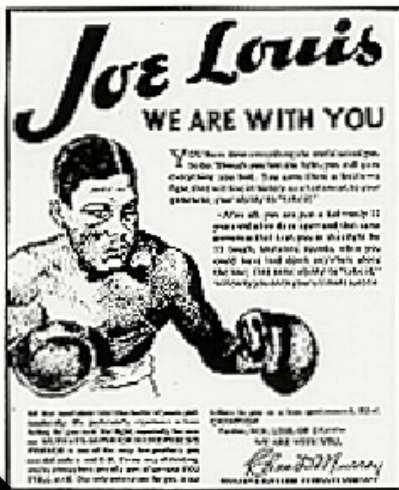
This tribute to Louis after his defeat appeared in The Pittsburgh Courier, June 27, 1936.